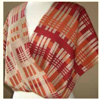
A garment woven by Karen Donde

"Do you ever get stuck trying to decide what to weave, knit, dye, or felt next? This lecture is designed to rev up your design engine and organize the many options available to you for creating cloth or the objects you make with it. Bring a stack of interesting pictures cut from magazines or old calendars, collecting whatever catches your eye. We will sort these by various design parameters and analyze your favorites. I'll then offer a few simple design tips and tools to help you formulate them into a design for your