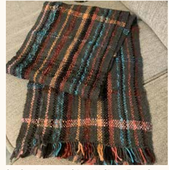
Scarf made as part of the 2022 Shave 'Em to Save 'Em program

which she is currently working on sewing a garment from. She's also sampling on her rigid heddle loom. Some of her favorite projects are made on her smaller looms due to their portability, and sewing bags hold a special place in her heart.